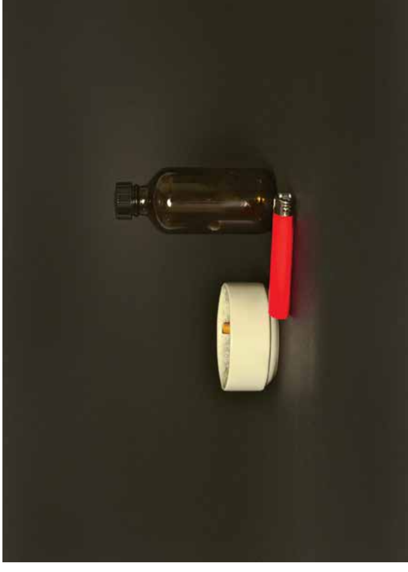
(i) Detail of Triptych #4 , 2009, C prints, books on shelf, paper clips, and inkjet print, dimensions variable. (ii) Detail of Common Elements , 2013, fifty-four framed text panels, fourteen framed C prints, five wooden sculptures, five painted white plinths, and caption.